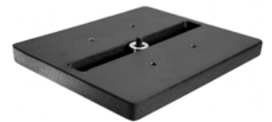
6" x 7" Platform

That's all there is to it - you've just selected a custom Majestic Gearhead designed for your camera and your tripod, ready to provide years and years of continuous use in a demanding professional environment.