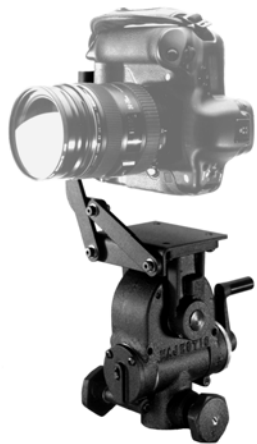
MAJESTIC 1200 SERIES Model 1210 Shown