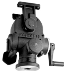
Model 1000 Screw Mount