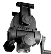
Model 1200 or 1900 Post Mount