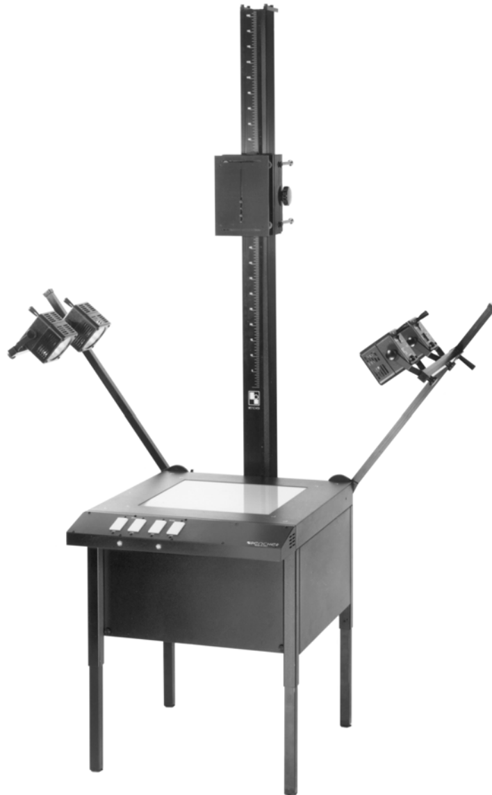
HALOGEN FLOOR ILLUMA